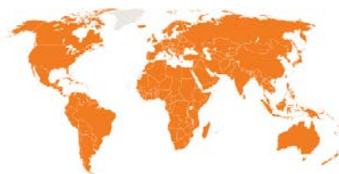
Geographies covered by Euromonitor International

We are the strategic resource of choice for: